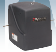
Slide Gate Operator