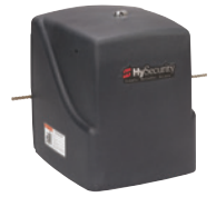
Slide Gate Operator

HySecurity operators secure the world's critical infrastructure and key assets where ultimate reliability is vital. SlideSmart DC delivers that same uncompromising quality to commercial customers, where ease of use, consistent operation, low maintenance, long life and high reliability is expected.