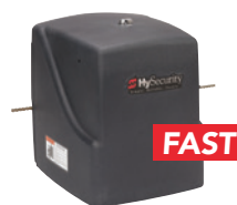
SlideSmart DC 10F SlideSmart DCS 10F (solar) 1,000 lb (453 kg) gates 1.75, 2 or 2.25 ft/s (53, 61 or 69 cm/s)