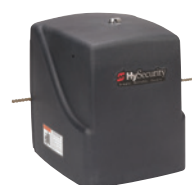
SlideSmart DC 15F SlideSmart DCS 15F (solar) 1,500 lb (680 kg) gates 0.75, 1 or 1.25 ft/s (23, 30 or 38 cm/s)