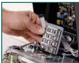
modular design makes installation and service easy