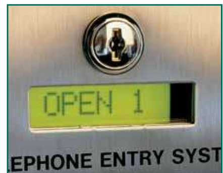
built-in display indicates door/gate has been opened