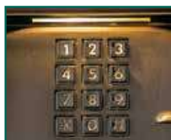
lighted keypad and display