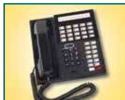
dtmf tone output useable with PBX, KSU and telephone systems with auto-attendants